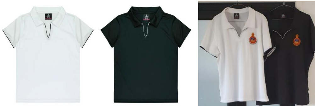
AUSSIE PACIFIC POLO SHIRT with EMBROIDERY on right side

Informal Occasions: (Coffee mornings, bus trips, social gathering) Black tops with your choice of bottom half. Wearing of medals: Large medals are worn for events that commence in the day time; Miniatures are worn for events that commence at night; Ribbons are worn during the day for non-Ceremonial events.