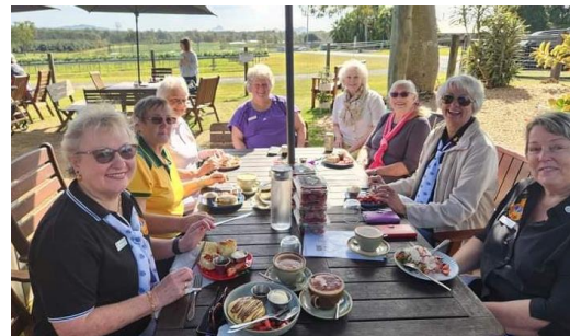
26 July – from each end