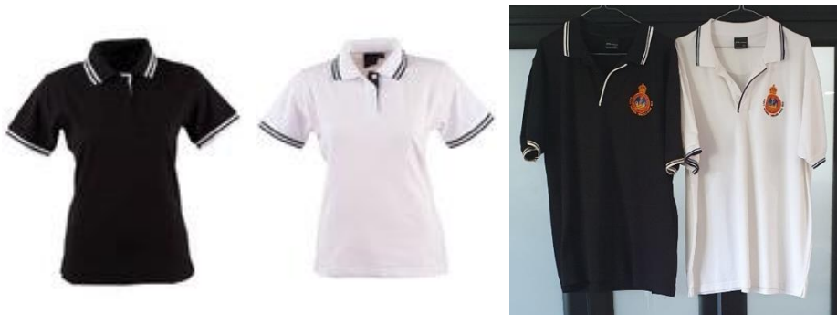
POLO SHIRTS with EMBROIDERY on right side

Formal Occasions: (Funerals; ANZAC Day) White skirt, pants or dress, worn with the white shirt, black jacket with the magnetised pocket badge, and white hat with our Tally Band. Shoes to suit. Alternatively, the black blouse can be worn in lieu of white shirt and black jacket.