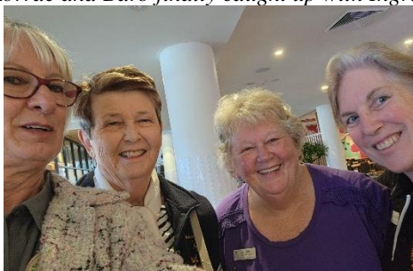
Navy Veterans trying for a selfie