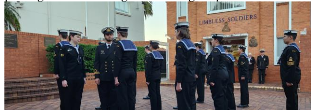
Cadets being inspected

On 6 March, the Executive attended a Passing Out Parade at TS Brisbane. The cadets ranged from a new Recruit through to the experienced 17 year old who was passing out and leaving the Training Ship.