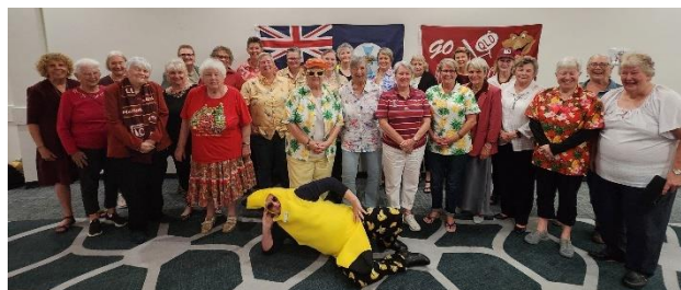
Navy Veterans celebrating Queensland Day at the Annual Birthday Party.

The SCESWA held their annual birthday party on 6 June at the Maroochy RSL. As the day was Queensland Day, the theme was something Queensland. Many turned up in Qld Origin colours, Brisbane Broncos colour, banana, and other Qld Themes. Each place had a paper Pineapple filled with 'bananas and strawberry' lollies, which the guest all enjoyed the thoughtfulness of the organisers. Toward the end of the event, everyone sang the Veterans Hymn. The sound of the ladies singing the song sent shivers down the spine of many a lady. It was then time to go home to Brisbane, Caboolture, Bribie Island, Bundaberg, Hervey Bay and, of course, the Sunshine Coast. What a great day it was. BZ (well done) to the Sunshine Coast ladies.