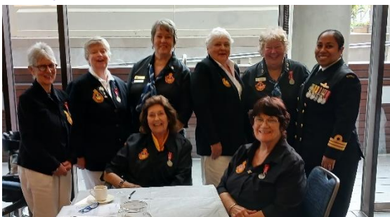
27 June – CESWA Ex Service Women's Church Service