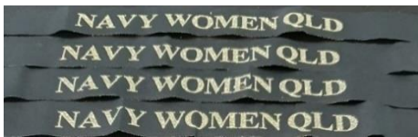
^ TALLY BAND