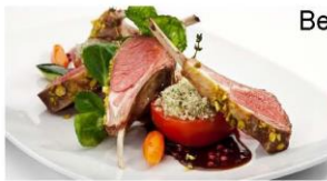
Beautiful 2 course lunch