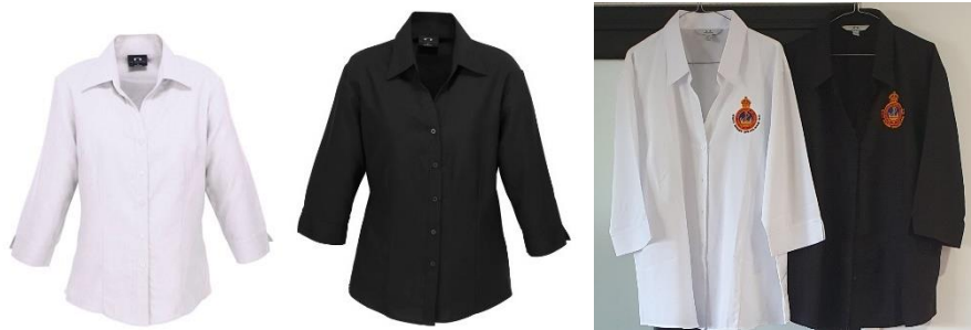
BIZ OASIS button front SHIRT with EMBROIDERY on right side

Informal Occasions: (Coffee mornings, bus trips, social gathering) Black tops with your choice of bottom half. Wearing of medals: Large medals are worn for events that commence in the day time; Miniatures are worn for events that commence at night; Ribbons are worn during the day for non-Ceremonial events.