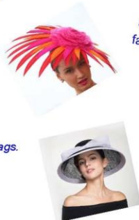
Glam up and wear your favourite hat to our lunch

Bank Transfer Acc Name: Navy Women (WRANS-RAN) Qld BSB No: 124 002 Acc. No: 22446885 Ref: (Surname) Lunch